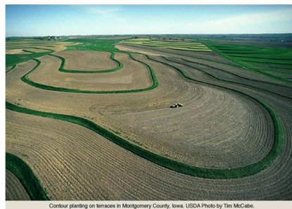
Contour planting on terraces in Montgomery County, Iowa.