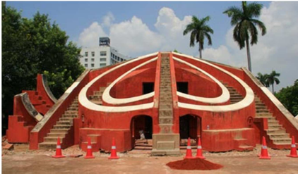
a) Jantar Mantar