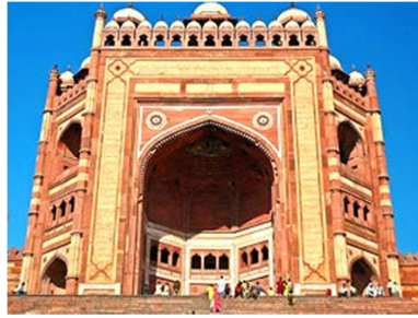
b) Buland Darwaja