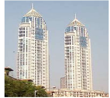
c) Imperial Tower