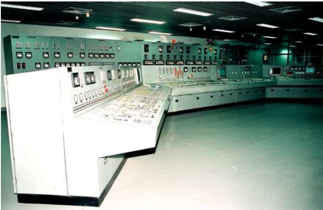
210 MW POWER PLANT SIMULATOR