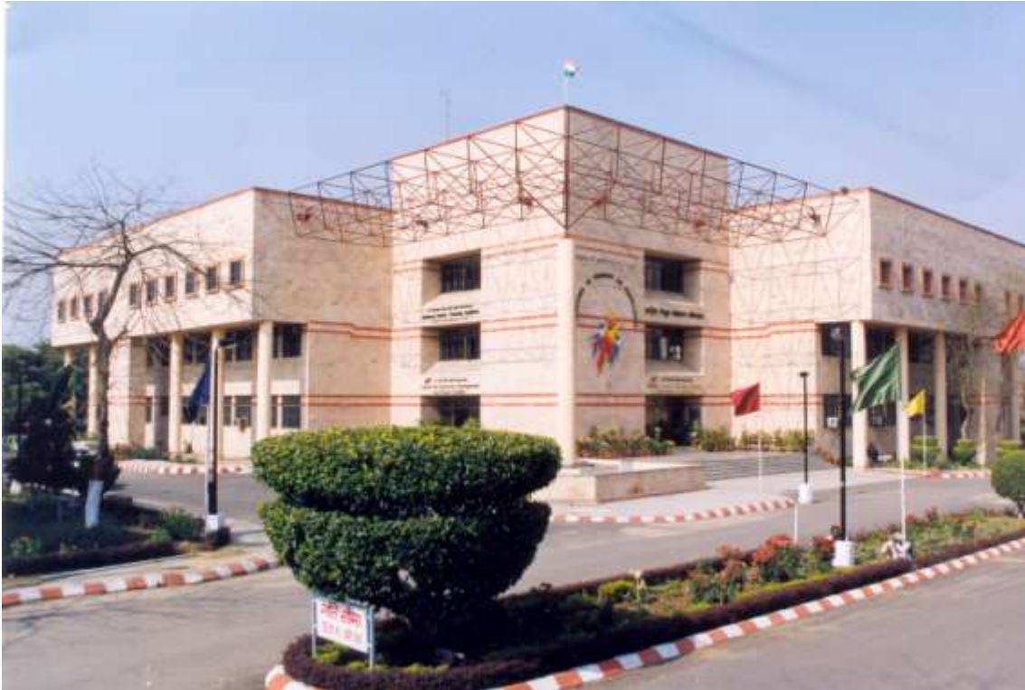
NPTI Corporate Centre