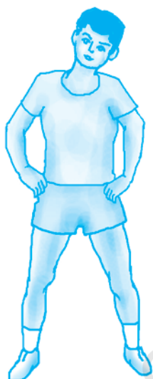
1. Head tilt (side to side)

Warming Up: Muscle stiffness is thought to be directly related to muscle injury and therefore, the warming up should be aimed at reducing muscle stiffness.