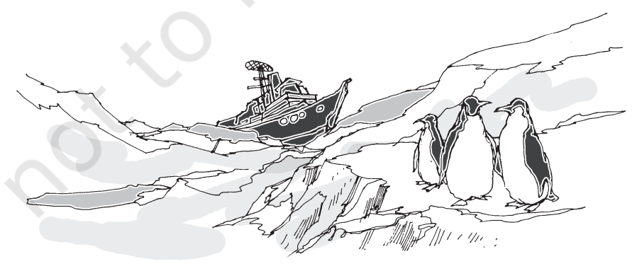
Journey to the end of the Earth \blacksquare 19

For a sun-worshipping South Indian like myself, two weeks in a place where 90 per cent of the Earth's total ice volumes are stored is a chilling prospect (not just for circulatory and metabolic functions, but also for the imagination). It's like walking into a giant ping-pong ball