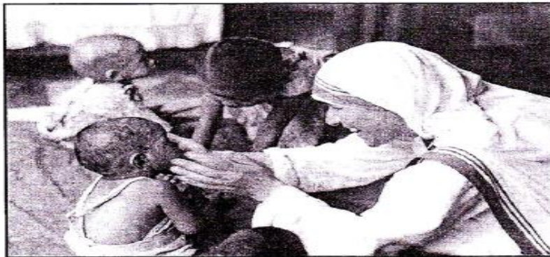
ANGEL OF MERCY