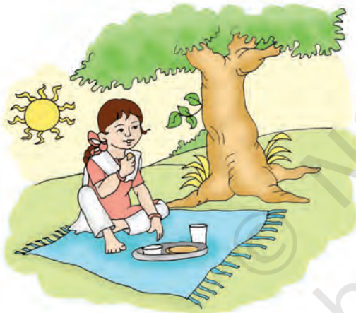
4. Eat lunch