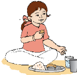
2. Eat breakfast