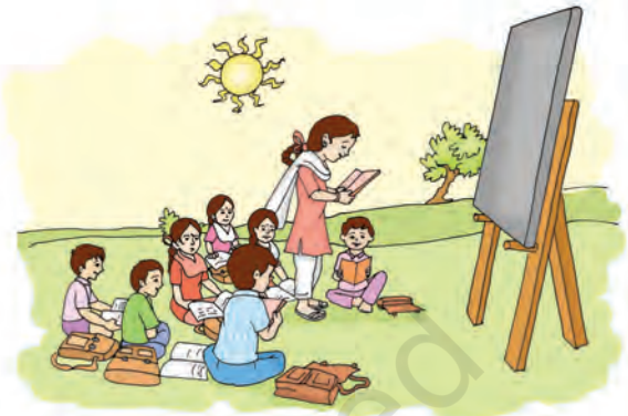
3. Read a story in school