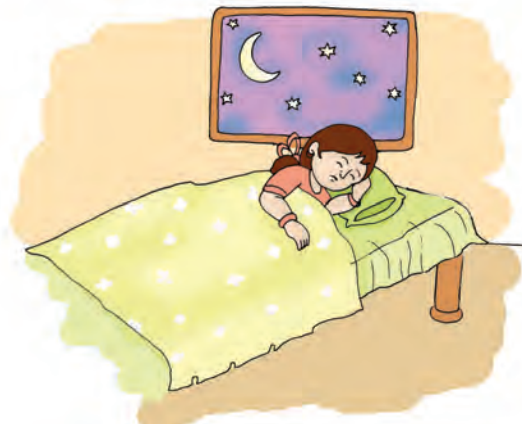
7. Go to bed