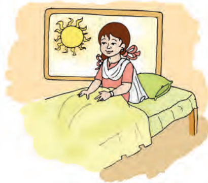
1. Get up for school