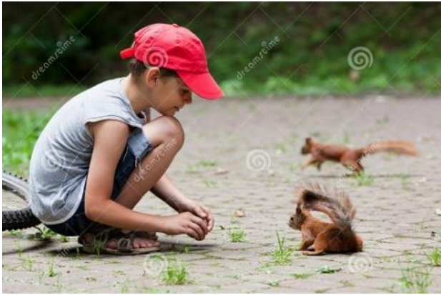
The boy's friendship with the squirrel

3. What are the main events in the story?