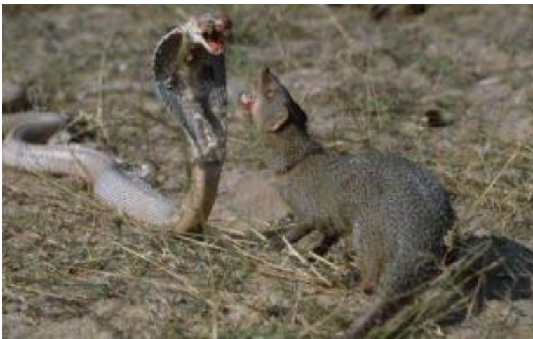
The fight between mongoose and cobra