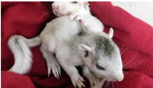
Friendship of the white rat and the squirrel – 3 babies