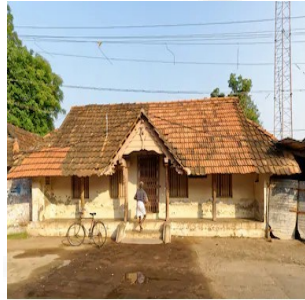
Old tiled roof