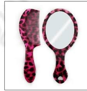
Mirror and Comb

The doctor was staying in a small rented room, because, his income was meagre. He decided to write a letter to his friend describing the life in that rented room. Prepare it.