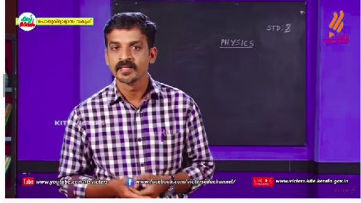
KITE VICTERS STD 10 Physics class 15 (First Bell-എസ് എസ്)

1. It is possible to convert electrical energy to other forms. Write the energy conversion in the following equipments