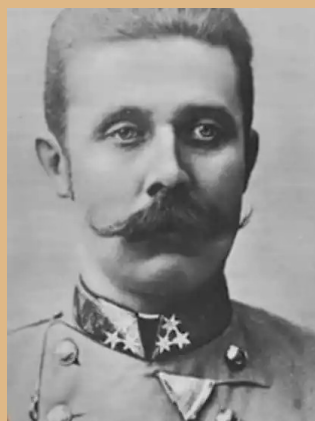
ആർച്ച് ഡ്യൂക്ക് ഫ്രാൻസിസ് ഫെർഡിനാൻഡ്

Hints: Moroccan Crisis, Balkan Crisis, Assassination of Francis Ferdinand