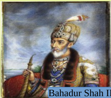
Bahadur Shah II