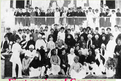
First session of Congress

2. Who introduce the “Drain Theory “ ? Which of his book addresses this idea?