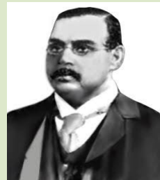
Romesh Chunder Dutt

4. List out the earlier leaders who made the common people aware of the economic policy of British impoverished India