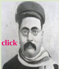
Gopal Krishna Gokhale