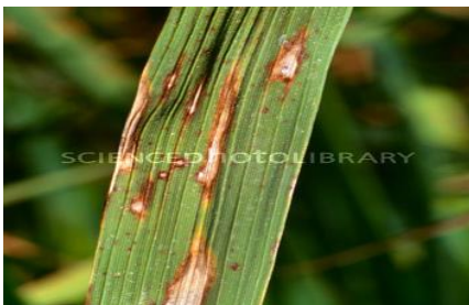
Blight disease In paddy