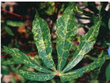
Mosaic disease in tapioca