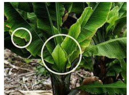
Bunchytop of banana