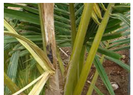
Budrot of coconut