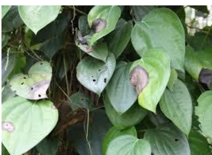
Quickwilt In pepper