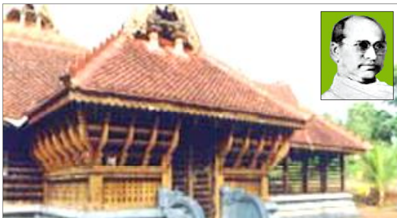
Kerala Kalamandalam & the founder, Vallathol Narayana Menon (inset)