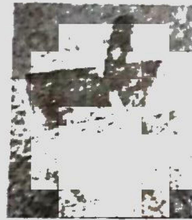
Pic - 3