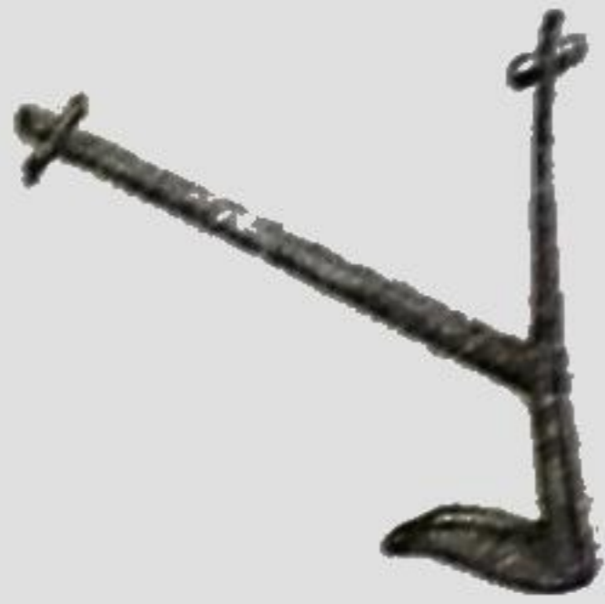
Pic - 1