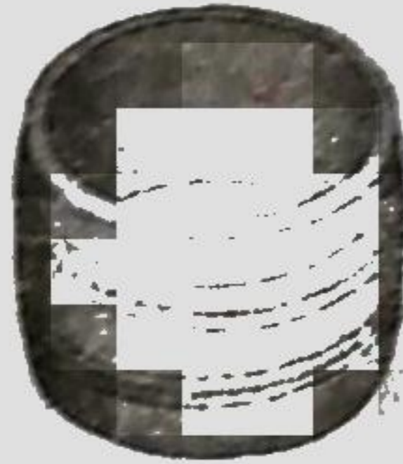
Pic - 2