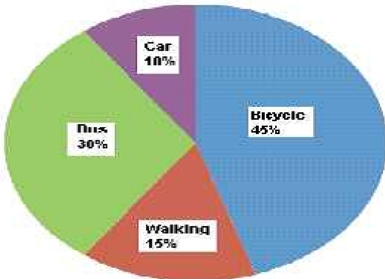
Types of Transportation