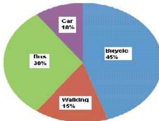
Types of Transportation