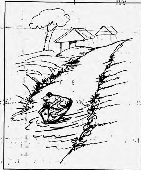
The frog jumped in to the boat. They sailed to the seashore happily.