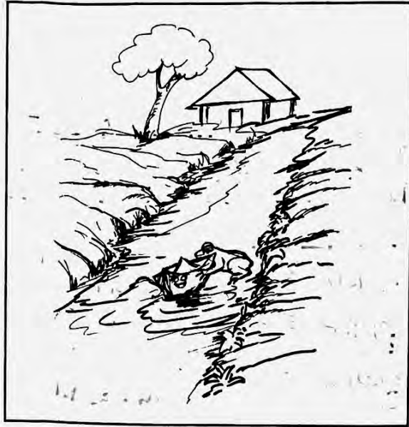
A frog saw this. It pushed the boat down.