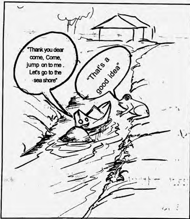
Pappu said, "Thank you dear. Come on, let's go to the seashore."