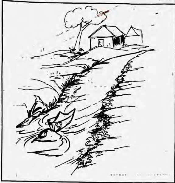
Suddenly, it got stuck with a stone.