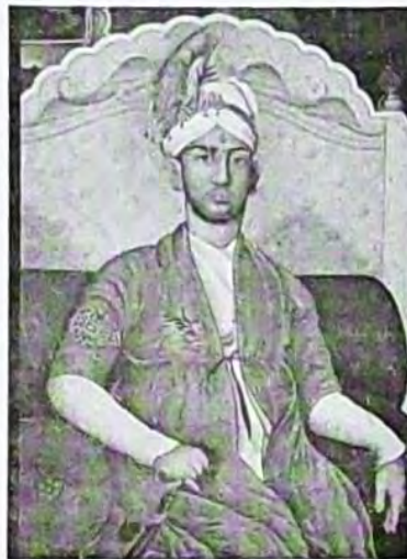
(Swathi Thirunal, Irayimman Thampi, Kunchan Nambiar, Udayavarma Kolathiri)